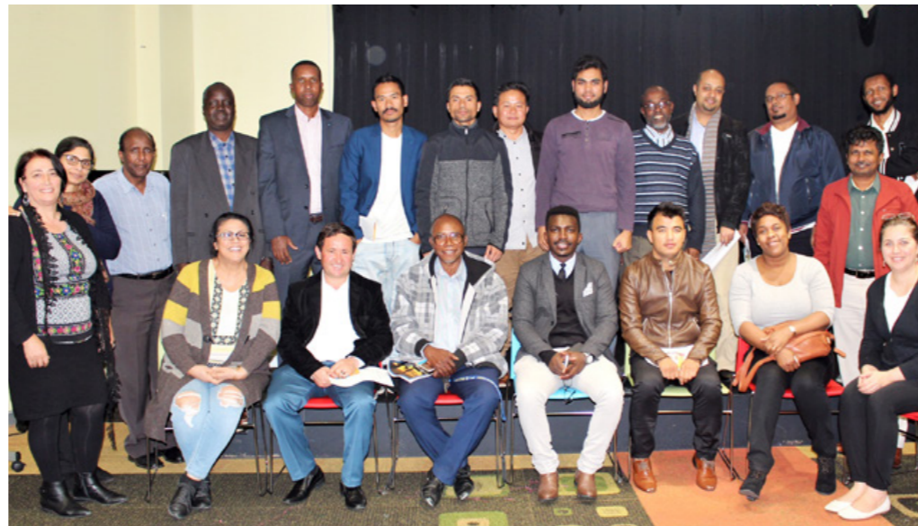
MDA Community Leader's Gathering, 2018