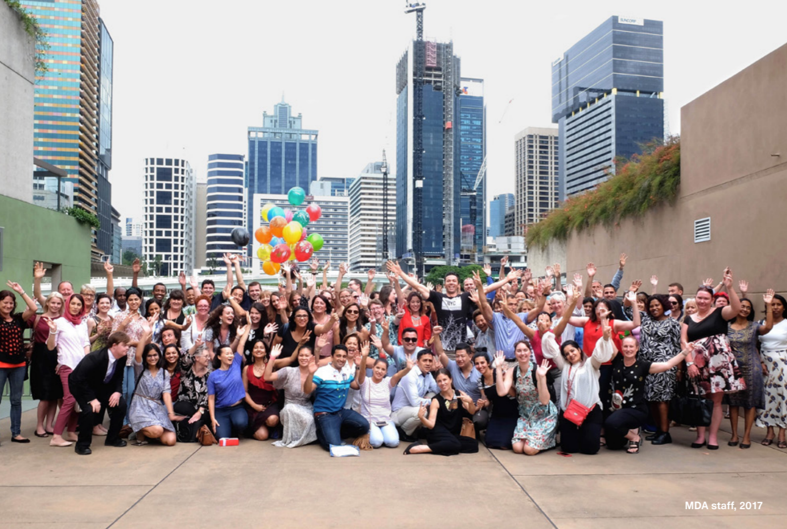
MDA staff, 2017